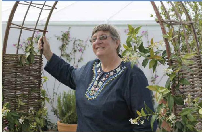
Christine Walkden Christine is a television presenter, celebrity horticulturalist and plantswoman, best known for her appearances on gardening programmes, The One Show and BBC Radio 4's Gardener's Question Time.